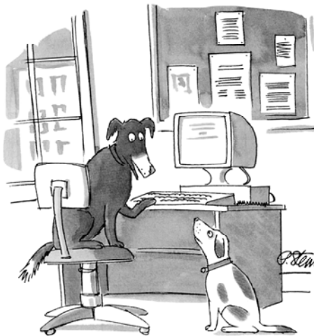
"On the Internet, nobody knows you're a dog."

© The New Yorker Collection 1993 Peter Steiner from cartoonbank.com. All Rights Reserved.